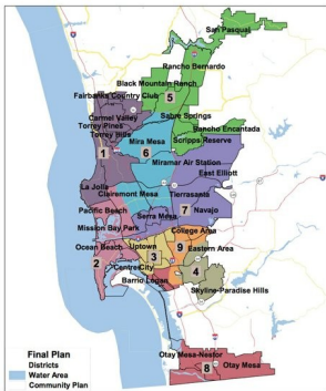
FINAL REDISTRICTING PLAN FOR THE CITY OF SAN DIEGO

We've heard a lot about the redistricting process over the last few months, usually in reference to the creation of new boundaries for the City Council districts and the addition of a new ninth council district. While the City Council redistricting process has been the most visible, the process of redistricting takes place at EVERY level of government every 10 years, following the publication of the decennial census results.