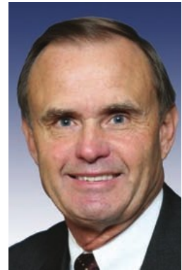
Congressman Brian Bilbray.

"We appreciate this effort by the Congressman to help expedite this long-delayed project."