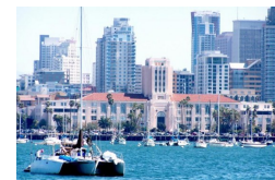
San Diego Bay

“We do not expect to change the rating within the outlook’s two-year horizon based on our belief (that) management will likely maintain good finances and reserves,” the S&P report stated.