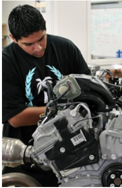
A student works on a motor donated by Toyota