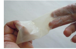
Apex Medical Technology’s male condom made with collagen fibrils that provide a hydrated micro-rough skin-like surface texture to facilitate heat transfer and produce a more natural sensation.

Apex has 12 to 18 months to develop its design, afterward the foundation will award $1 million to the most promising condom.