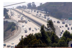
San Diego Freeway funded by Transnet

dido to San Diego; the widening and realignment of SR 76 from Oceanside to I-15 (the segment from South Mission Road to I-15 is under construction and expected to be finished in 2015); public acquisition of South Bay Expressway/SR 125 and the subsequent reduction of tolls by up to 40 percent; extension of SR 52 from I-15 through Santee to SR 67; and the addition of HOV lanes on I-5 (Manchester Avenue) and I-805 (Carroll Canyon Road).