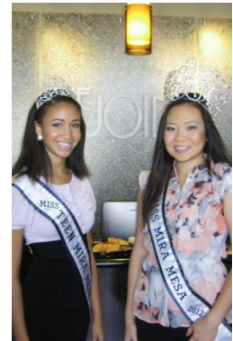
Miss Mira Mesa and Miss Teen Mira Mesa at the grand opening of The Joint Chiropractic.