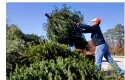
Curbside yard waste residents may drop their Christmas trees in their green waste container.