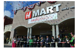
H Mart Grand Opening.

H Mart joins a growing number of Asian grocery stores, such as, Seafood City, Vinh Hung and Lucky Seafood, in Mira Mesa, signaling a growing Asian population. According to the 2010 census, Asians make up 46 percent of the more than 72,000 residents of Mira Mesa.